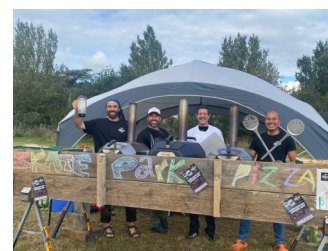
Pizza stall at Harfest

The initial designs proposed skatepark designs are available the Council's website: