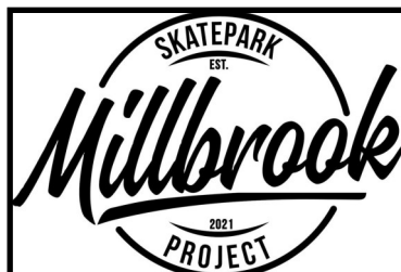
Millbrook Skatepark Project logo